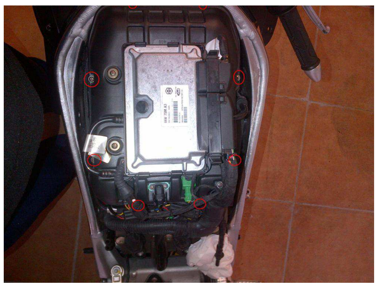
Disconnect also the fuel lines for the lower front/rear injectors, the stepper motor of the variable geometry intake system.

Lift the airbox cover and rotate it to rearside.