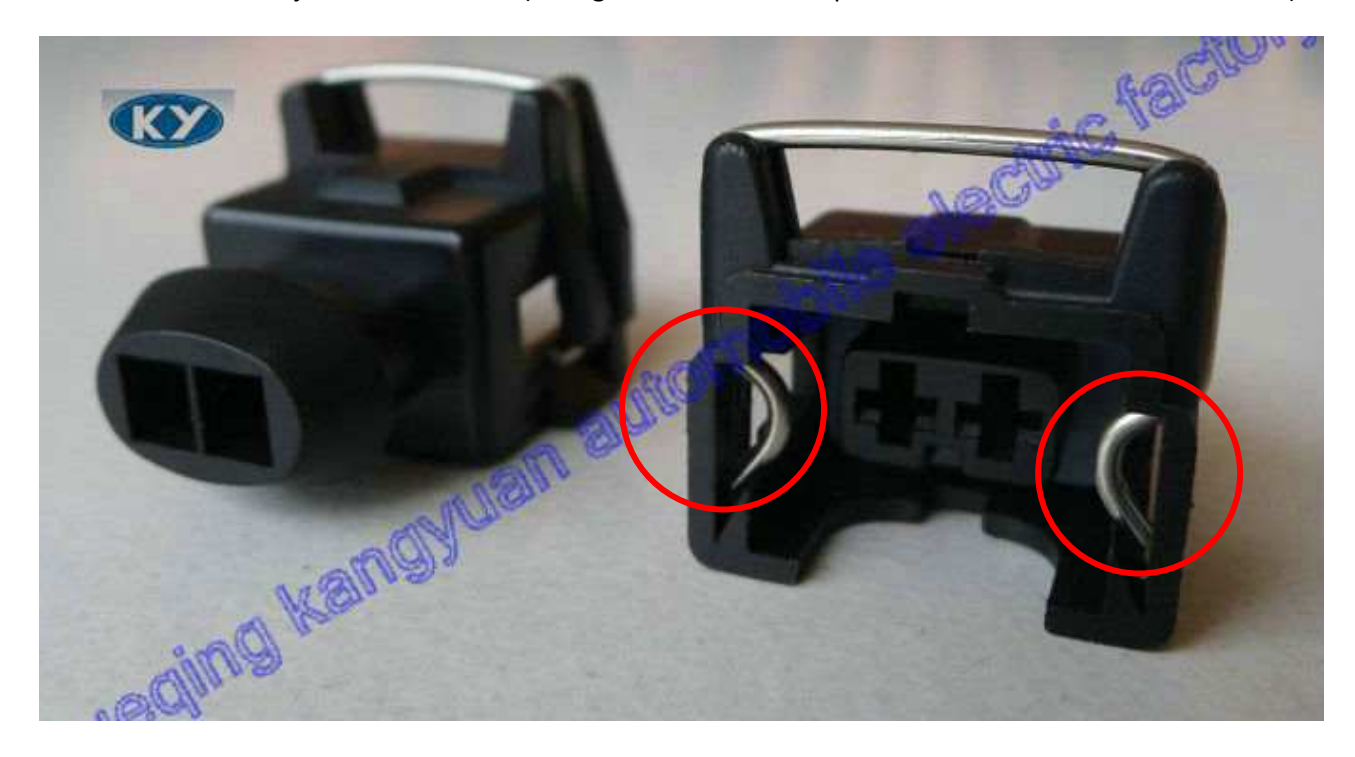
11.Lift the front throttle body until it is out form the rubber manifold; disconnect the electrical wire of throttle body (same procedure of injectors).

10.Disconnect the injectors connectors (enlarge the metal wire clip with tool "C" on the red circled zone):