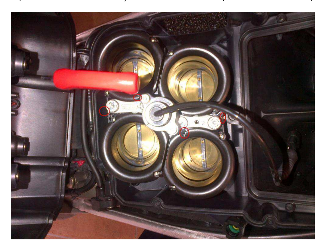
Remove the variable geometry connector from the airbox cover.

3. Using tool "A", unscrew the 4 screws with cylindrical head that fixes the variable geometry trumpets on the airbox (BE CAREFULL: remove exactly the 4 screws circled in red; don't touch the others!):