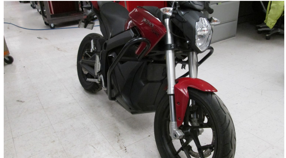
Figure 1: Completed Bike (SR)

Purpose: The purpose of this procedure is to provide a dealer or other technical resource with the instructions necessary to install a Frame Protection Bar Kit on 2014-2016 S/SR/DS Zero Motorcycles.