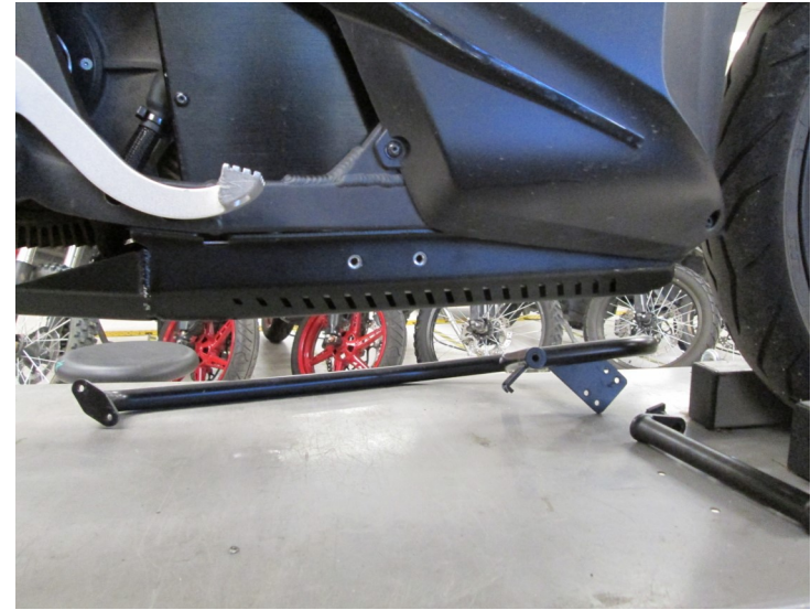
Figure 4: Skid plate and Side Fairings Installed

4. Install new skid plate, 26-08051, using existing fasteners.