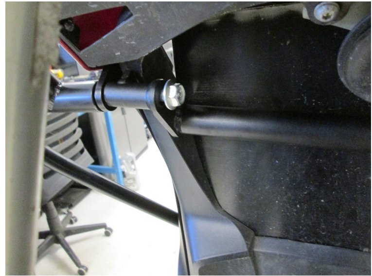
Figure 7: Upper Cross Bar