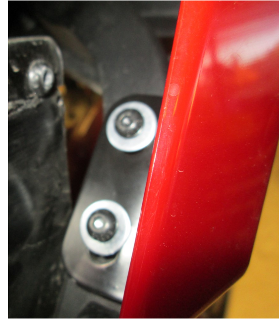
Figure 9: Upper Frame bracket fasteners

7. Torque upper frame bracket fasteners that were installed in step 6. See figure 9.