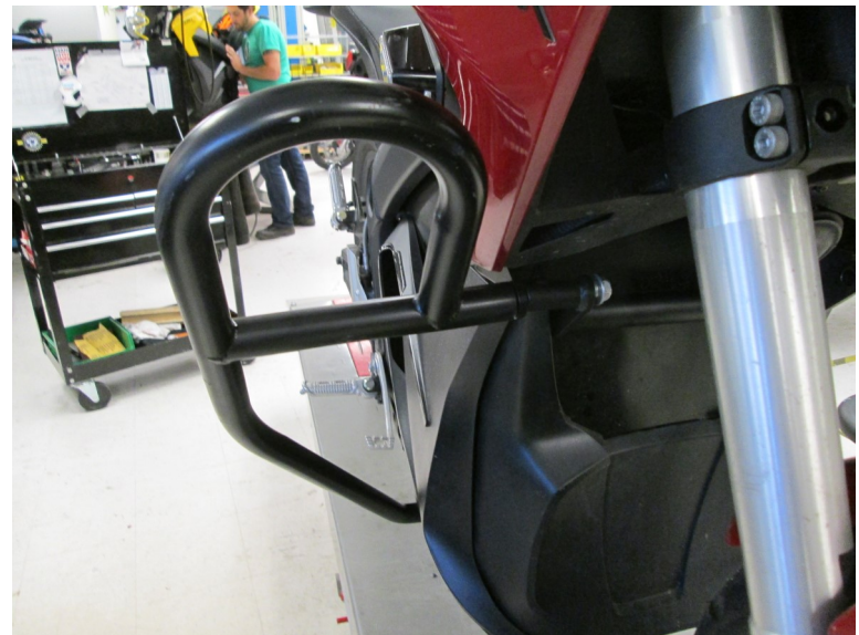
Figure 8: Upper Cross Bar to Drop Bar