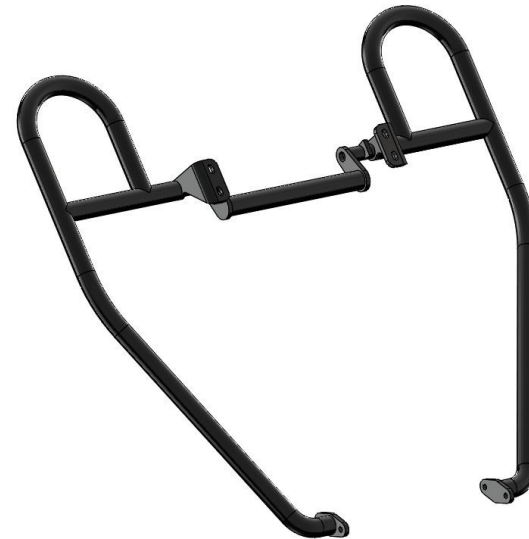
Figure 2: Frame Protection Bars

Place motorcycle on a level surface and ensure bike is turned off.