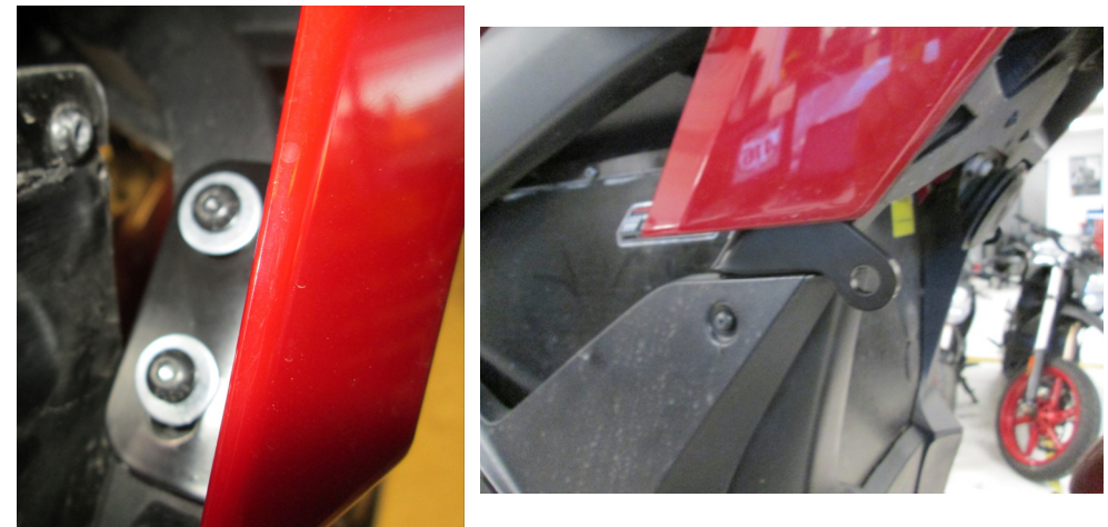
Figure 5: Upper Brackets installed

5. Install left and right upper brackets (20-06975 and 20-06977). Using 2x M5x20 Button Head Cap Screws (90-07256) and 2x M5 Flat Fender Washers (90-02107) per bracket. Leave hand tight for fitment. See figure 5.