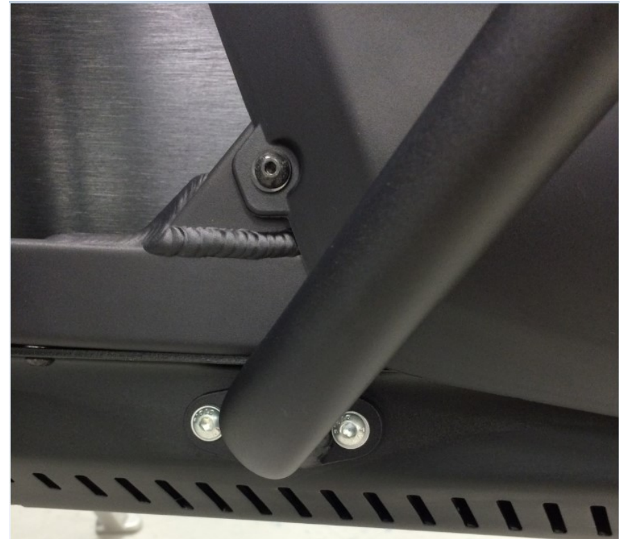
Figure 6: Drop bar to Skid plate Fasteners